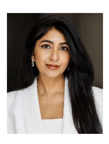
26th February 09:30 - 10:10