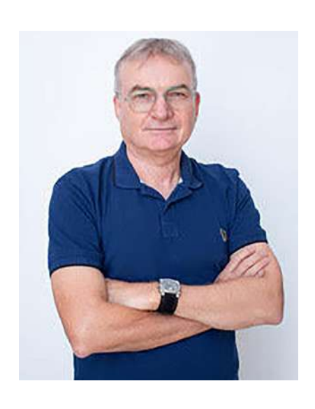
25th February 11:30 - 12:30