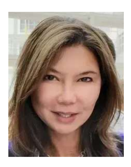
25th February 14:00 - 14:40