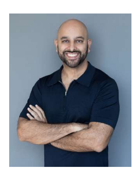
Co-Founder & General Partner VentureSouq