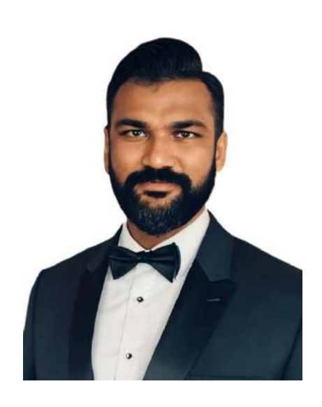
26th February 11:10 - 11:50