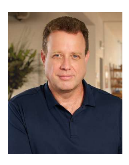
25th February 16:00 - 16:20