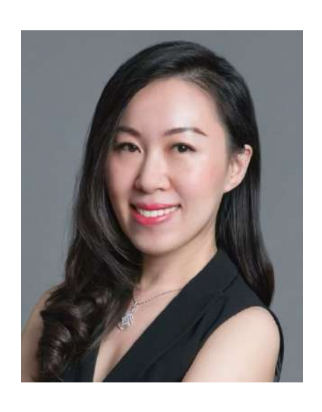
26th February 09:30 - 10:10