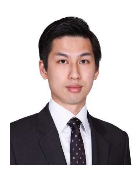
25th February 09:10 - 10:00