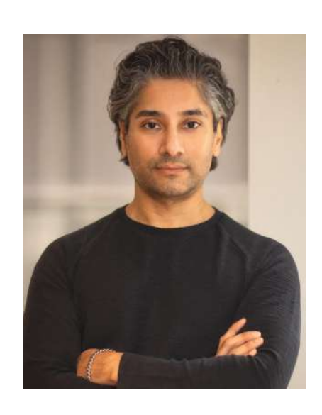
25th February 11:30 - 12:30