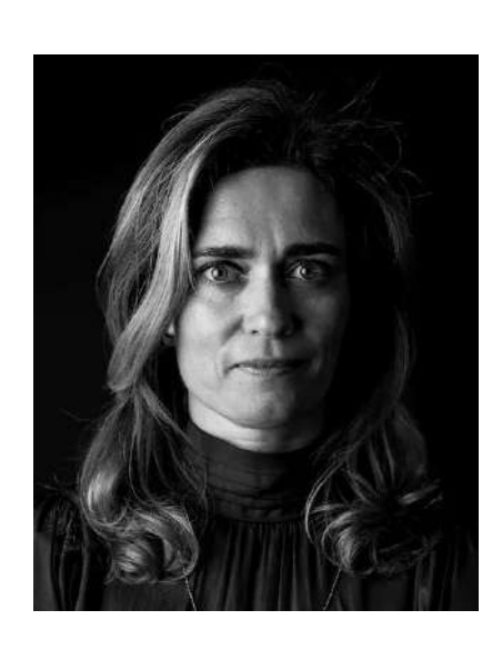
25th February 16:20 - 17:00