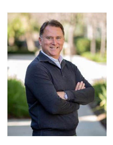
25th February 14:00 - 14:40