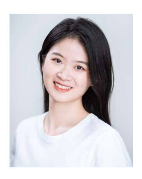
26th February 09:00 - 09:30