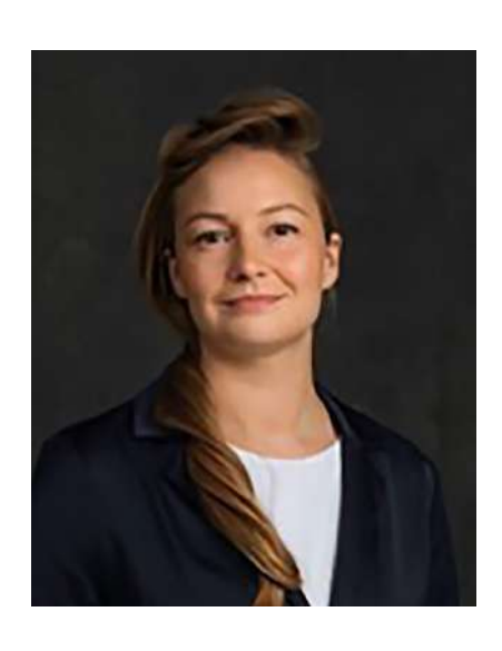
25th February 16:20 - 17:00