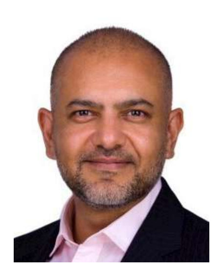
25th February 10:00 - 10:50